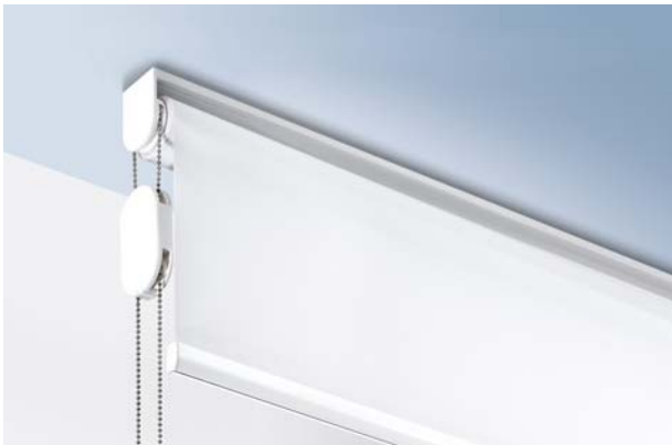
Silent Gliss child safety device – for absolute safety!

Innovations from Silent Gliss – for more safety at home!