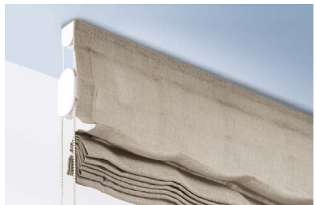
Roman blind system with child safety device