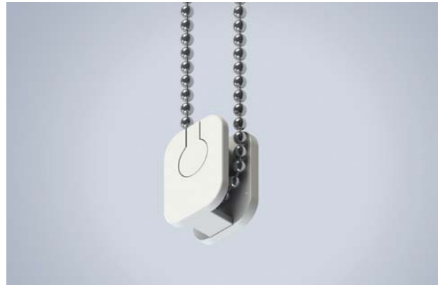
The standard cord retainer