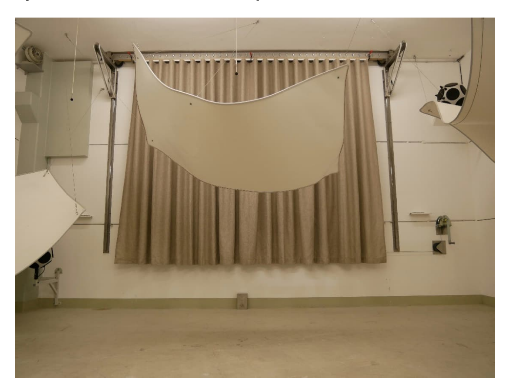
Figure B.1. Flat hanging curtain in the reverberation room: frontal view.