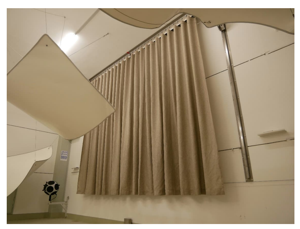
Figure B.2. Flat hanging curtain in the reverberation room: diagonal view.